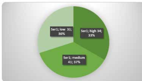
Fig. 2. Distribution of subjects by level of self-esteem

High self-esteem is characterized by a person's overestimation of their positive qualities, which is manifested through the reduction of their strengths or exaggeration of shortcomings. A person with high self-esteem is more active, self-confident, does more thoughtful actions, is independent in his own judgments, perceives criticism as an "attack" on his own dignity. Such people are often optimistic because they are more likely to do their thing. When raising self-esteem, keep in mind the other extreme - aggressive narcissism, which is an undesirable and negative result of improper personal development. Positive is the conscious increase in self-esteem through self-education and personal development.