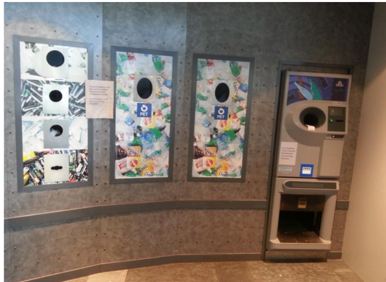
Figure 3. Special installations in shopping centers

Other materials can also be returned to controlled waste collecting centers. Typical recycling materials are: