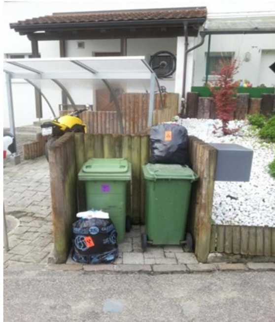
Figure 2. The place for waste containers

The biological waste is then putted in controlled green container in front of every house (Fig. 2). The other (mixed) waste is collected in special black plastic bags with labels which people have to buy. Thus, two waste collection cars are necessary. It is possible to produce gas from biological waste under an anaerobic process. Also, one can compost biological waste – the product is composted earth and can be sold in garden centers for flowers.